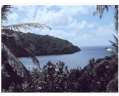
The Caribbean Sea Large Marine Ecosystem.

Many of the countries of this LME are poor and overcrowded. Because the Caribbean climate is so suitable for year-round tourism, many locals are pursuing it as a means of earning their living. The importance of the tourism industry is attested by the number of cruise ships in the area. The cruise industry has expanded tremendously in the last couple of decades. While tourism is expected to increase, it is not always reliable and consistent from year to year, especially since the Caribbean region is prone to hurricanes. The increase in tourism is also expected to contribute to more environmental degradation. Caribbean economies need to diversify. For information on tourism, see UNEP's Caribbean Environment Program site.